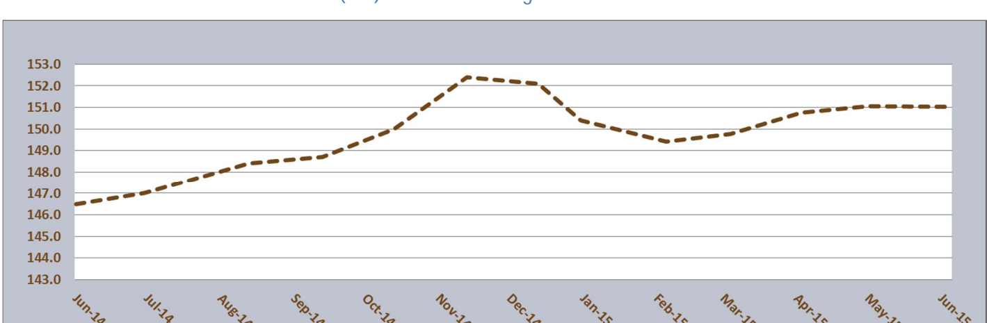
Price Index (CPI) in Kurdistan Region June 2014 - June 2015

CPI reached 151.01% in June 2015. it is very close to May 2015 in number and recorded an increase of 3.1% compared with June 2014.